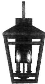
Park Harbor Outdoor Entrance Wall Light PHEL4502BLK Black