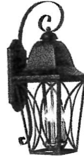
Park Harbor Outdoor Entrance Wall Light PHEL4202BBRO Black Bronze