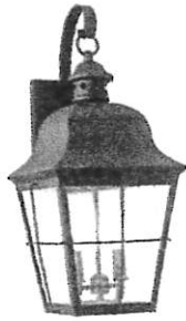
Generation Lighting Outdoor Entrance Wall Light GL8463EN46 Oxidized Bronze