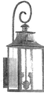
Troy Lighting Outdoor Entrance Wall Light TBCD9002OBZ Old Bronze