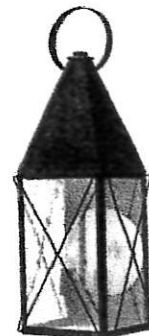
Hinkley Outdoor Entrance Wall Light H1844BK Black