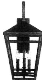
Park Harbor Outdoor Entrance Wall Light PHEL4503BLK Black