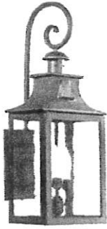
Troy Lighting Outdoor Entrance Wall Light TBCD9005OBZ Old Bronze