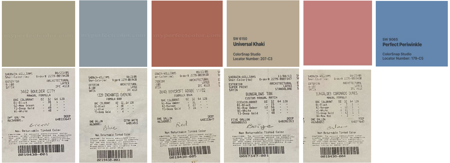
BoulderCityPPG 3462 EnchantedEvening SW1229 RoycroftAdobe SW0040 UniversalKhaki SW6150 CoronadoDunes 240E-3 PerfectPeriwinkleSW9065