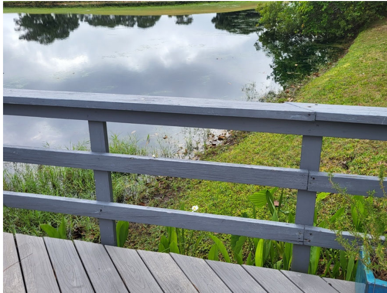
Figure D2 – Alternate Linkside Deck Railing Design